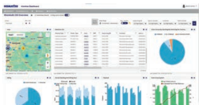
CEO overview display template