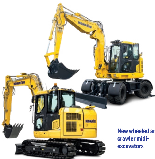
New wheeled and crawler midi- excavators