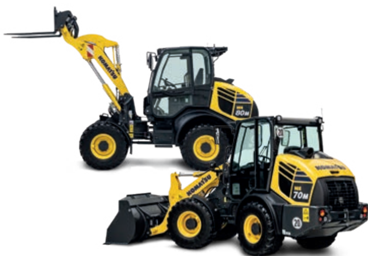
Compact wheel loaders