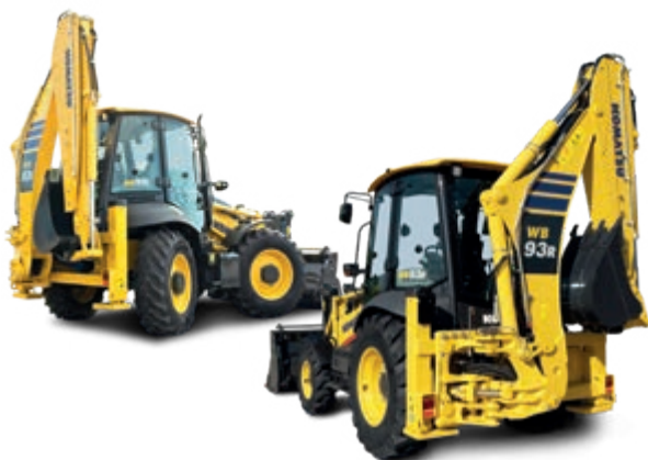
New rigid and 4-wheel-steering backhoe loader models