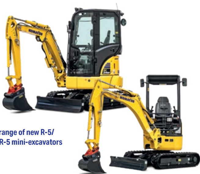
A range of new R-5/ MR-5 mini-excavators