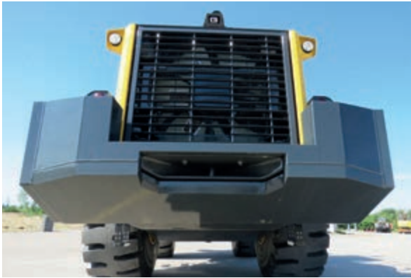
Heavy counterweight (4.975 kg)