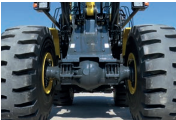
Reinforced axles and reinforced front frame