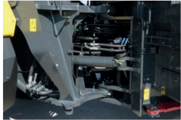
Reinforced center hinge pin, larger steering cylinders and adjusted hydraulic system