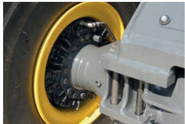
Axle oil cooling system