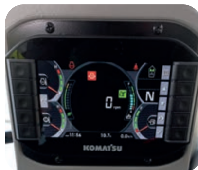
7" multi-function monitor