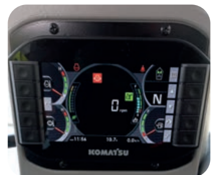
7" multi-function monitor