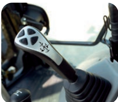
Convenient, ergonomic and precise control

A high-definition 7" LCD monitor provides excellent visibility. The high-definition LCD panel is less affected by the viewing angle and surrounding brightness, ensuring excellent visibility. Various alerts and machine information are displayed in a simple format. Useful information such as operation records, machine setting and maintenance data are also provided. The operator can easily navigate through screen pages with intuitive side buttons.