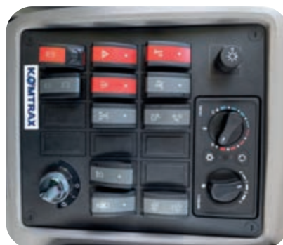
Ergonomically designed switches