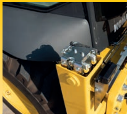
Anti-burst valves for stabilizers, boom and arm (Standard)